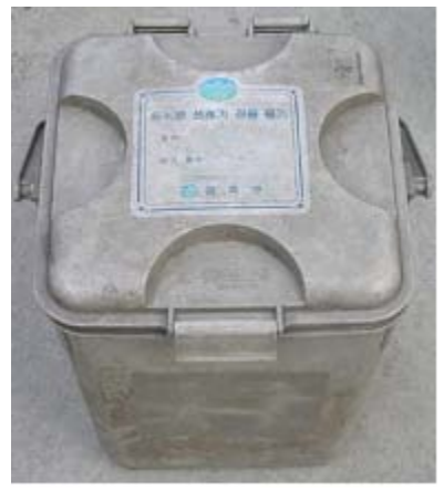
Food waste can