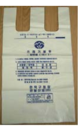
General waste bags